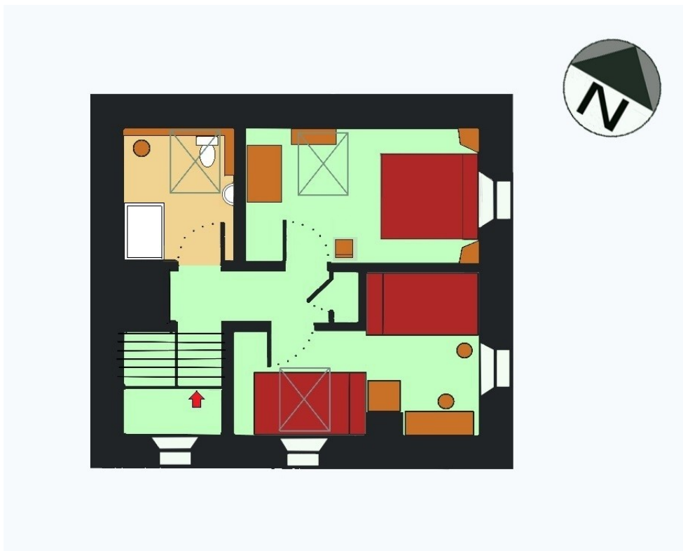
PLAN OF THE FIRST FLOOR OF THE GATEHOUSE

Heating is from an electric night-storage radiator.